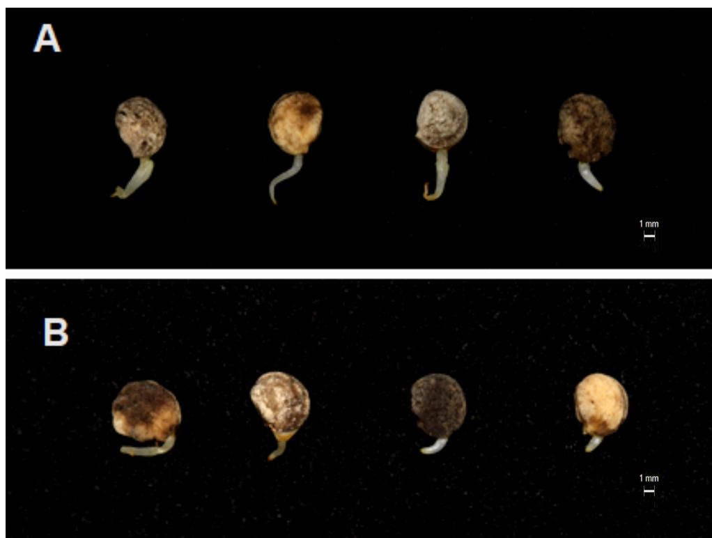
Fig. 2. Appearance of ginseng seedlings germinated under plant growth regulator treatments at 10°C. (A) Seeds treated with GA_3 ( 50 \text{ mg}\cdot\text{L}^{-1} ) + kinetin ( 50 \text{ mg}\cdot\text{L}^{-1} ); (B) untreated.